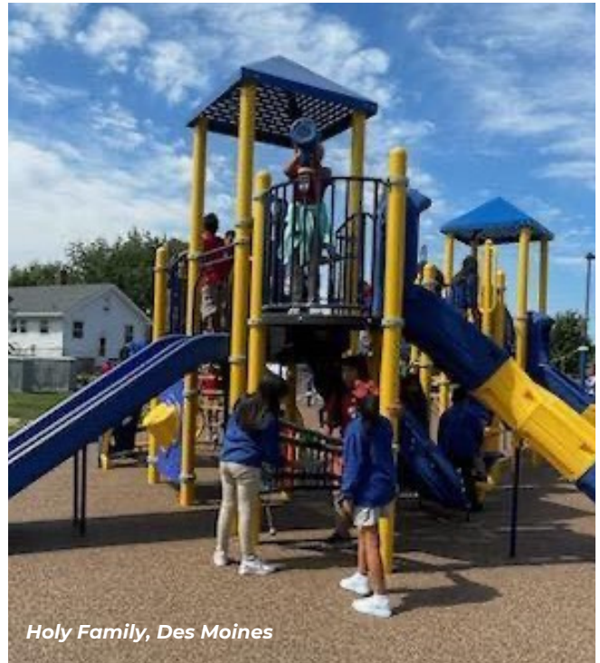
Holy Family, Des Moines

The new playground, equipped with modern, safe, and inclusive play structures, encourages physical activity and social interaction among students. This revitalized space supports children's holistic development by combining physical, intellectual, and spiritual growth.