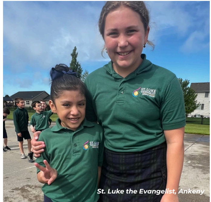
St. Luke the Evangelist, Ankeny