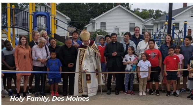
Holy Family, Des Moines