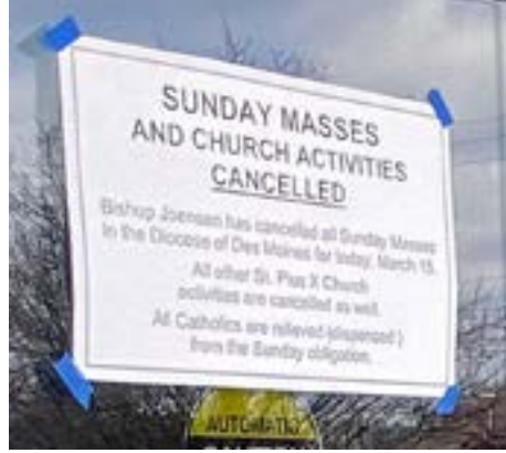
St. Pius X Church Urbandale