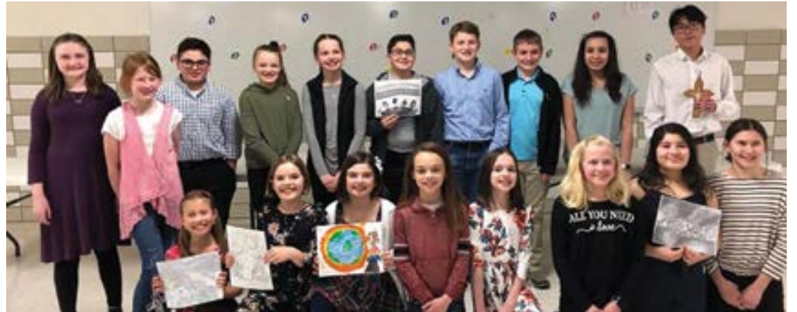
Pictured are the first, second and third place and honorable mention award winning students attending the Catholic Daughters Education Contest awards dinner at St. Albert School in Council Bluffs on March 2. Catholic Daughters Court St. Anthony #330 sponsors the annual contest in the areas of art, essay, computer art, photography, poetry and music.