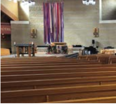
St. Francis of Assisi Church, West Des Moines