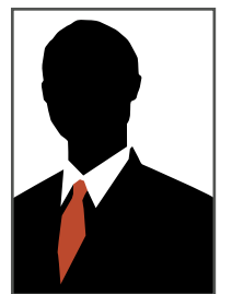
This can be you! Available in areas near you! Grinnell, Colfax, Newton and Des Moines

LIFE INSURANCE • DISABILITY INCOME INSURANCE • LONG-TERM CARE INSURANCE • RETIREMENT ANNUITIES