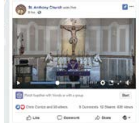
St. Anthony Church Des Moines