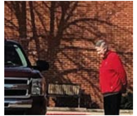
Holy Trinity Church Des Moines