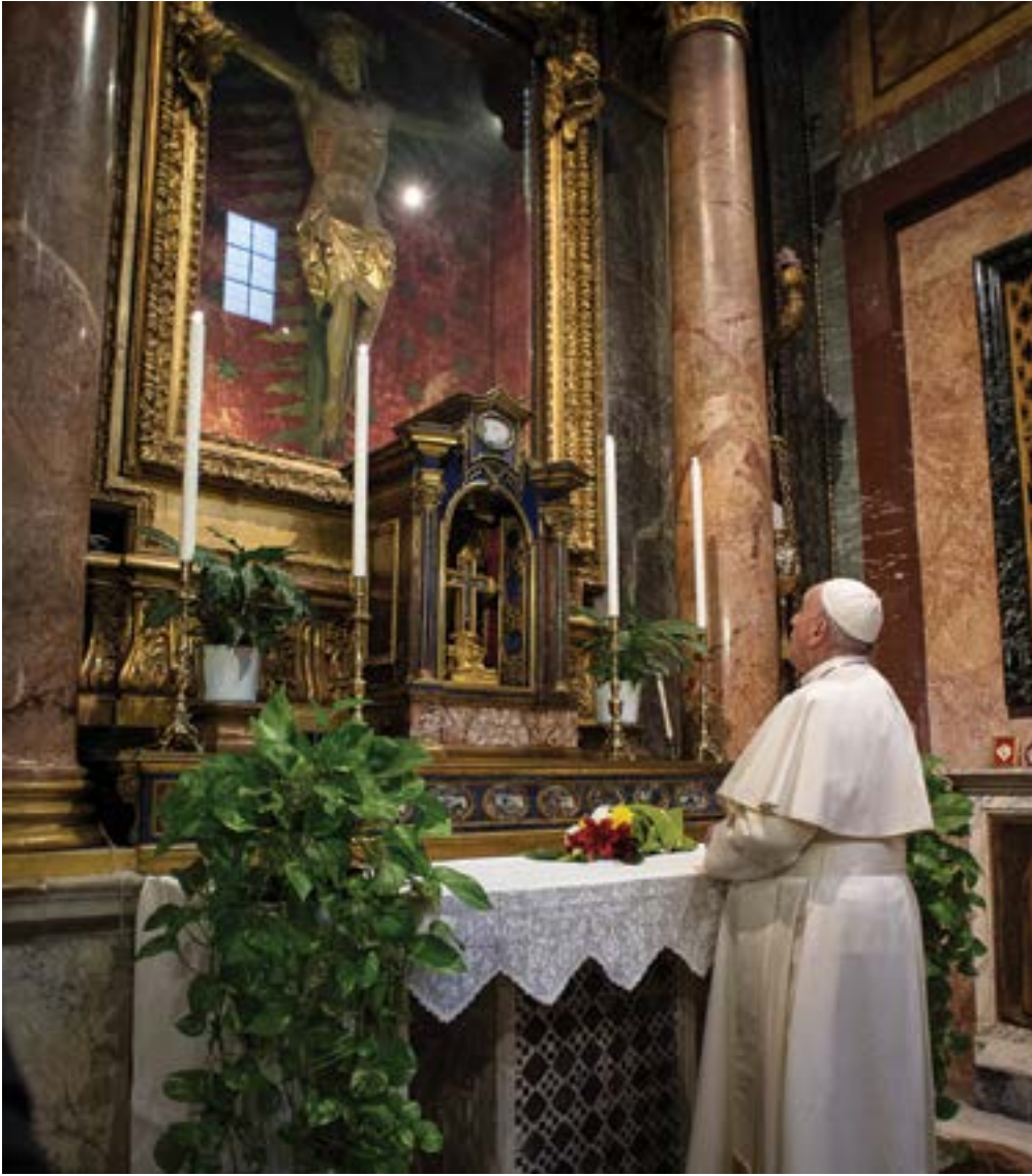
Pope Francis prays in front of a crucifix at the Church of St. Marcellus in Rome on March 15. The crucifix was carried through Rome in 1522 during the “Great Plague.” The pope prayed as coronavirus deaths peaked at 368 in a 24-hour period, bringing the total number of deaths to 1,809 out of 24,747 cases.

WASHINGTON- Archbishop José H. Gomez of Los Angeles, president of the U.S. Conference of Catholic Bishops, has issued the following regarding coronavirus COVID-19: