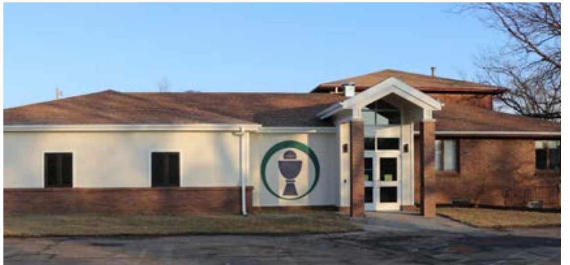
The groundbreaking ceremony for Corpus Christi Parish's new parish hall last July was part of Phase 1 of the parish's planned building project. The new parish hall is a 2,500-square-foot addition adjacent to the parish office and rectory. The new addition features a reception and greeting area, two restrooms, and three meeting rooms. In addition to the new building, Phase 1 included upgrades to the existing office and rectory, fresh paint, and upgrades to the building's lighting and HVAC system. The restrooms received a complete makeover with new plumbing, lighting and flooring.